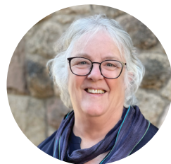
Charity Day President, Board of Directors