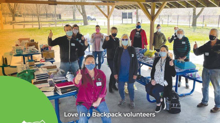
Love in a Backpack volunteers